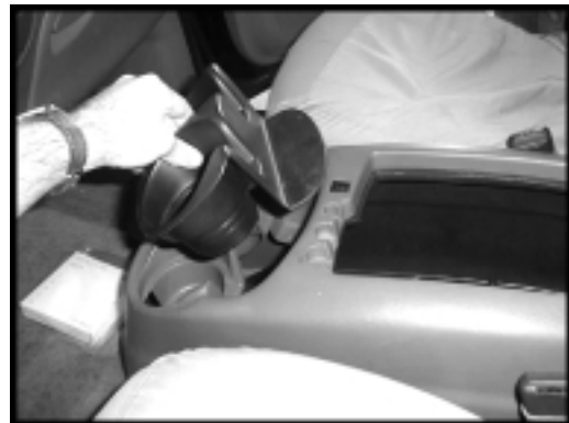
Cup holder size may differ depending on vehicle year.

STEP 2: Remove the four nuts holding the console to the floor. There are two in the front edge and two in the back edge..